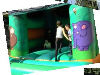
The Bouncy Castle