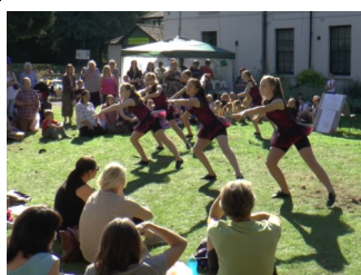
Gregory School of Dancing